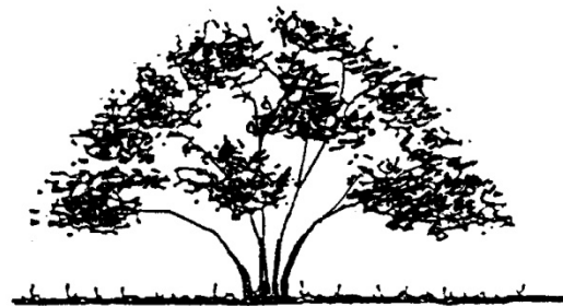
Chaparral Plant After Pruning

Step 4: Dispose.... of the cuttings and dead wood by either hauling it to a landfill; or, by chipping/mulching it on-site and spreading it out in the Zone 2 area to a depth of not more than 6 inches.