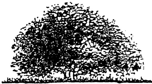
Chaparral Plant Before Pruning

Remaining plants, 4-ft or more in height, should then be cut and shaped into “umbrellas.” This means pruning one half of the lower branches to create umbrella-shaped canopies. This allows you to see and deal with what is growing underneath. Upper branches may then be shortened to reduce fuel load as long as the canopy is left intact. This keeps the plant healthy, and the shade from the plant canopy reduces weed and plant growth underneath. Non-woody vegetation that is under 4 feet in height, like coastal sage scrub, should be cut back to within 12 inches of the root crown.