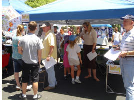
PQ-NE Action Group was represented at the 2007 and 2008 PQ Fiestas