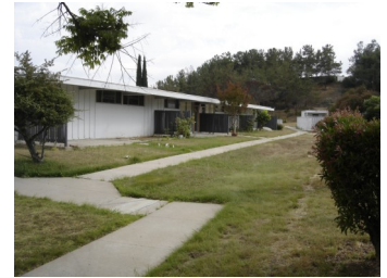
Demolition started this month of Leisure Life Apartments in preparation for a 368 unit Cresta Bella condominium complex. Re-development of the Doubletree is no longer imminent.

We see this change as a positive for our community. The downside is that this redevelopment does not need public review, it proceeds only through ministerial review by the city. As of this writing, permits have been received and demolition has commenced. The developer has promised to provide a copy of the plans to RPPB. Join our group or monitor savepq.org to get further details.