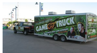
Game Truck will be a new attraction at the BBQ/Picnic this year

We will be raffling four Disneyland® Resort One Day